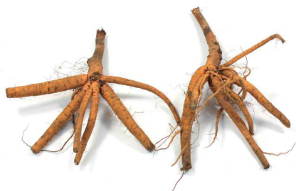
SHIPPED AS BARE ROOT DIVISIONS.

Note: Occasionally, bare root plants may arrive with a small amount of mold on them. This is caused by temperature changes encountered in shipping and does not harm the plants. As long as the bare root divisions are firm, simply wipe any mold off with a paper towel and plant them.